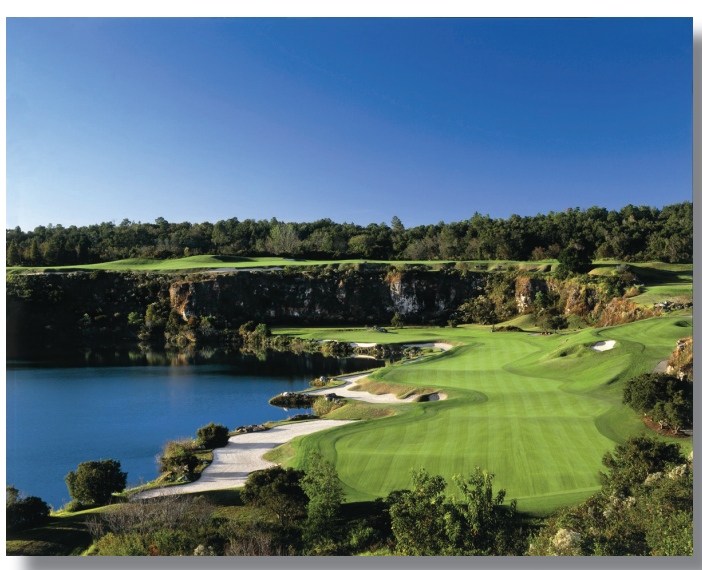
The 15th hole on the Quarry Course at Black Diamona

Save $10 & Enter Online at www.fsga.org!